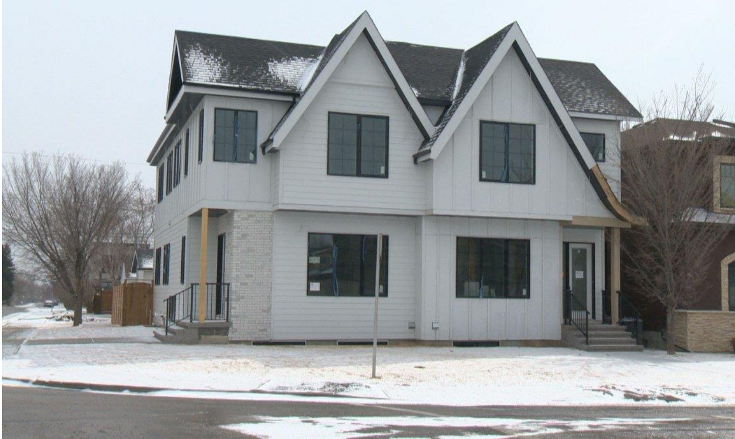
1704 - 27 St. SW located in community of Shaganappi in Calgary.