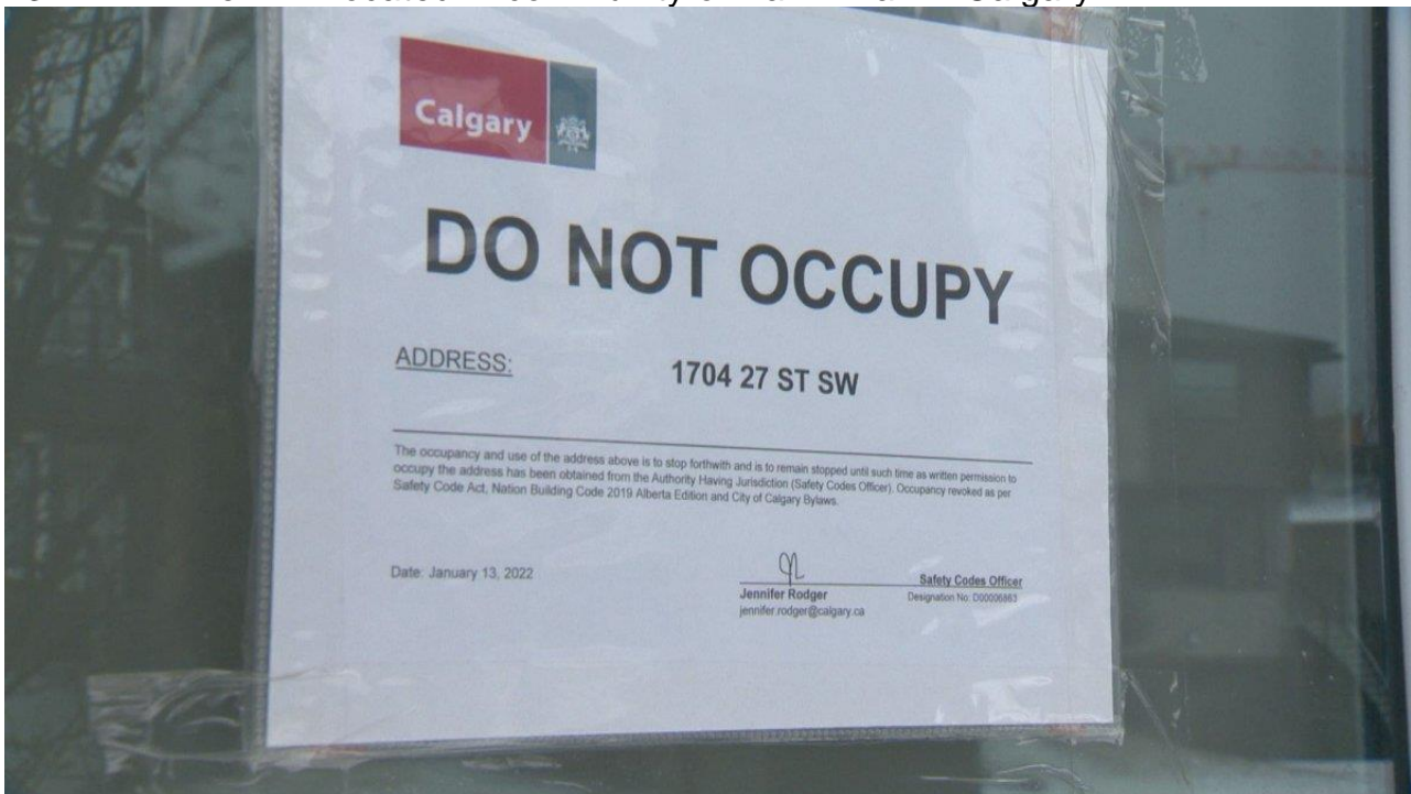
1704 - 27 St. SW located in community of Shaganappi in Calgary.