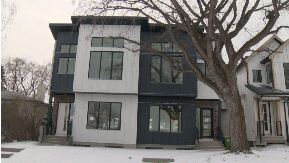
2327 - 27 Ave. NW located in community of Banff Trail in Calgary.