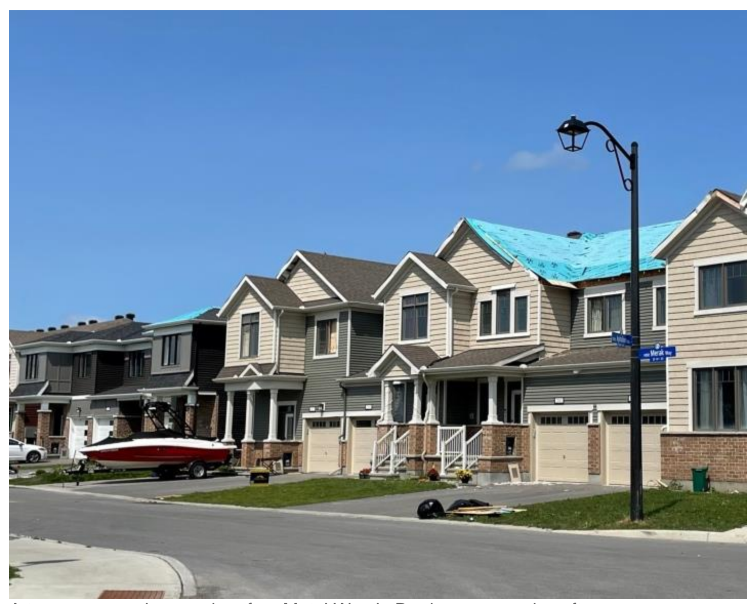
A tarp covers a damaged roof on Metal Way in Barrhaven, one day after a tornado ripped through the area.

Curbside removal of tree and yard debris will begin next week.