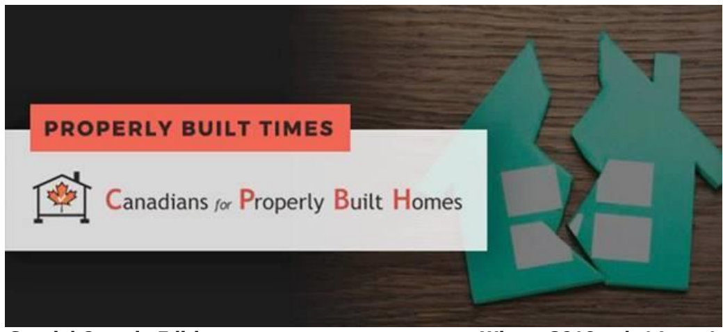
Special Ontario Edition