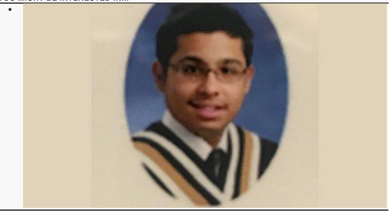
Troubling online posts surface after quadruple Markham murders