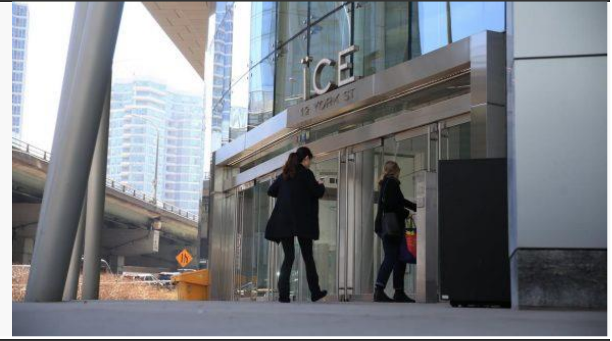
Rise of ghost hotels casts pall over Toronto rental market