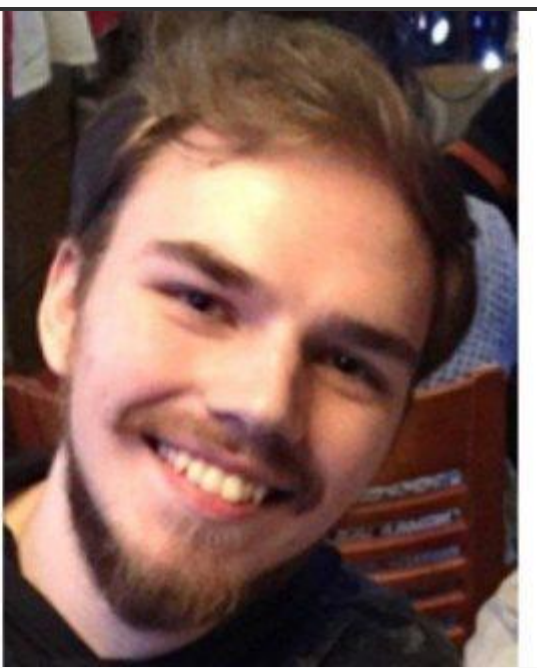
B.C. manhunt suspects recorded final message on phone found with bodies, family says

The report found that anonymous owners are concentrated in the high-end luxury market, far more likely to buy homes with cash, and when they do take out a mortgage, they rely on alternative lenders, which are not subject to the same anti-money laundering rules as banks.