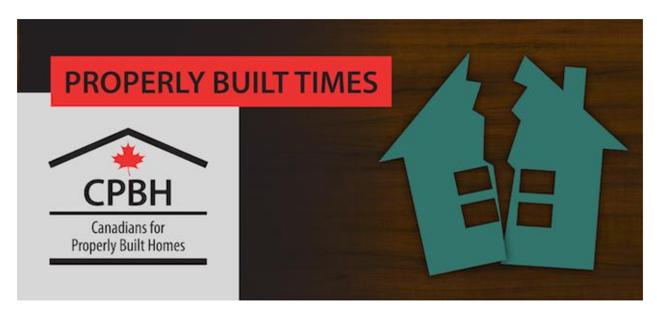
Volume 19, no. 4, Fall 2024, Ontario Edition